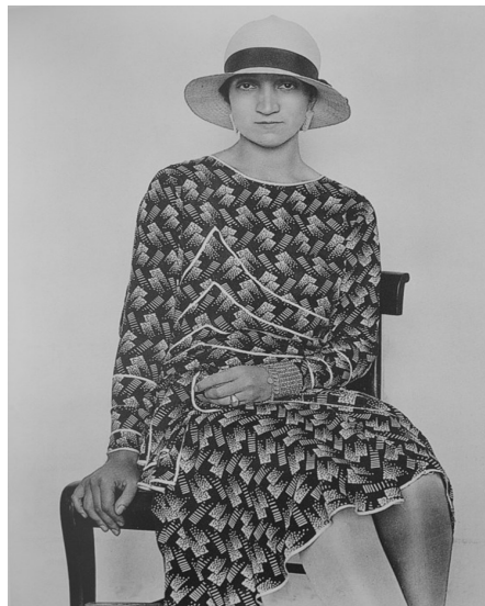
Figure 1. Antonieta Rivas Mercado (1900-1931)